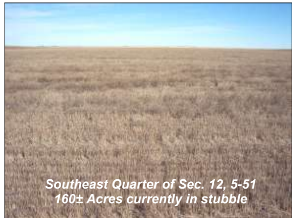
Southeast Quarter of Sec. 12, 5-51 160± Acres currently in stubble