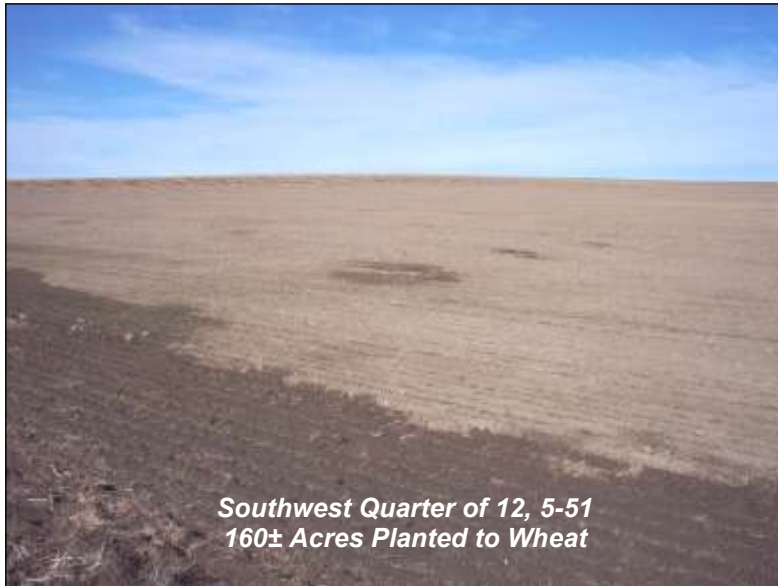
Southwest Quarter of 12, 5-51 160± Acres Planted to Wheat