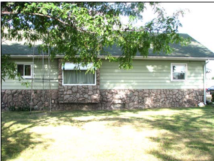
WEST SIDE OF HOUSE