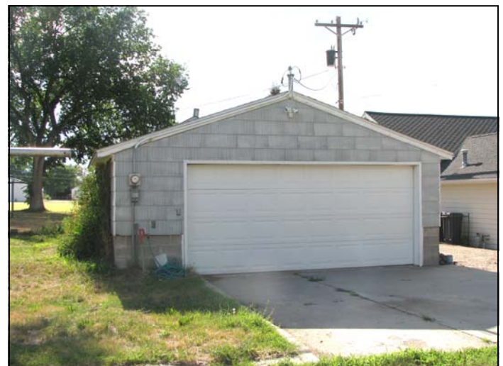
26' X 22' TWO-CAR DETACHED GARAGE