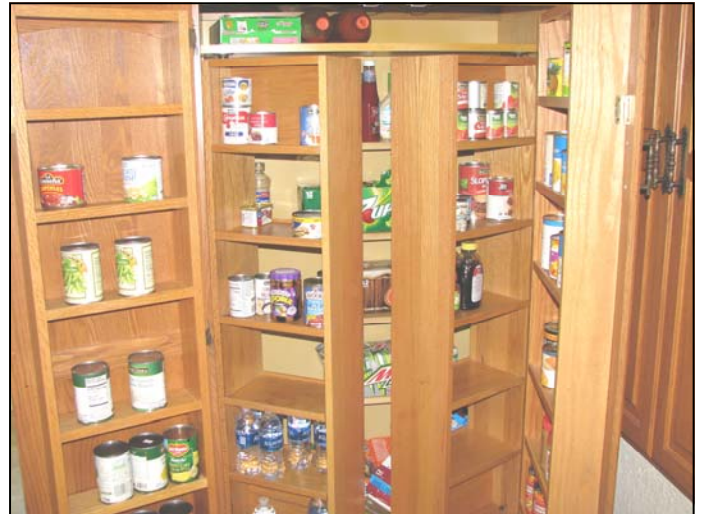
SWING OUT PANTRY