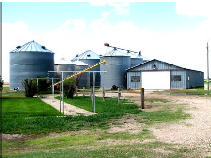
60'x32' BUTLER BLDG & GRAIN BINS