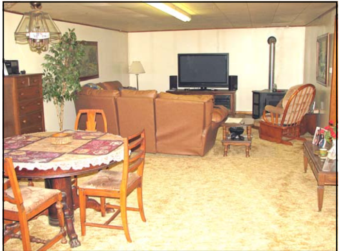
BASEMENT LIVING AREA W/PELLET STOVE