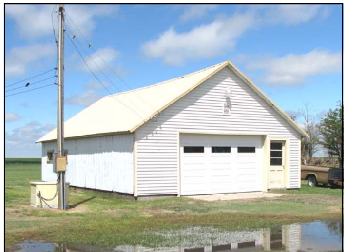
40'x26' TWO-CAR DETACHED GARAGE