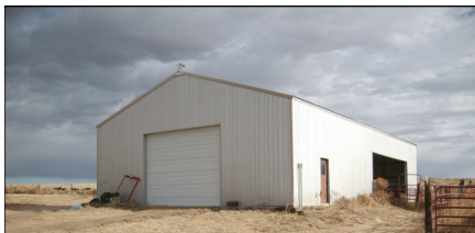
40'x60' Barn & Corrals

● Optional 207± Acres Grassland (owned by different Seller)