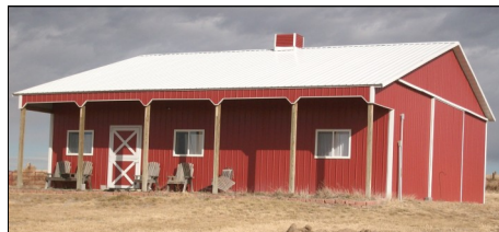
Shop with Living Quarters