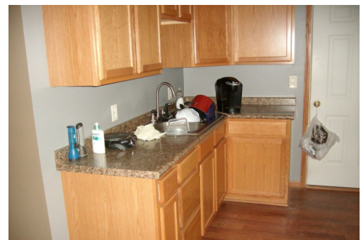
Open Kitchen - Living Area