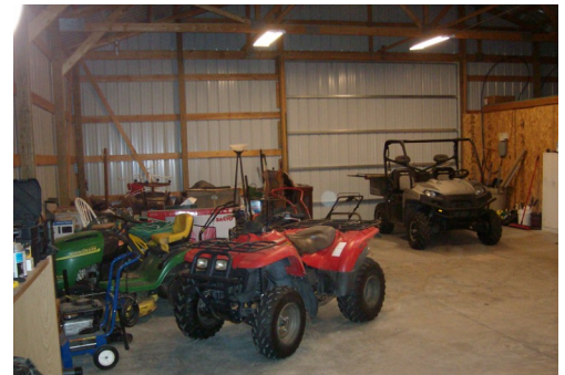
2,000 sq. ft. Shop Area