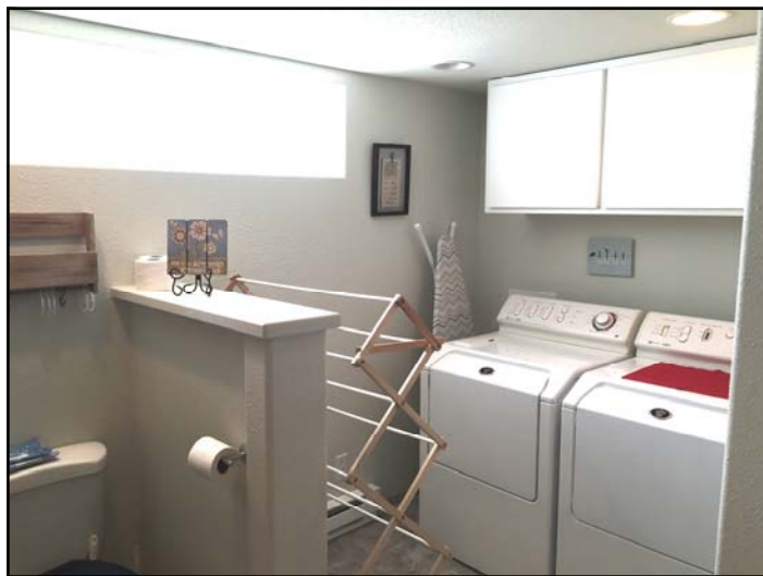
LARGE BATH/LAUNDRY IN BASEMENT