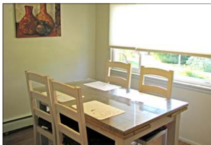
Breakfast Nook/Dining Area