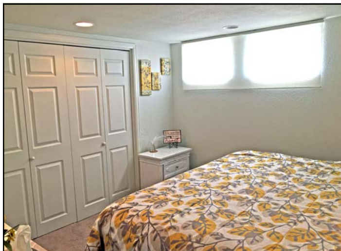
MASTER BEDROOM IN BASEMENT