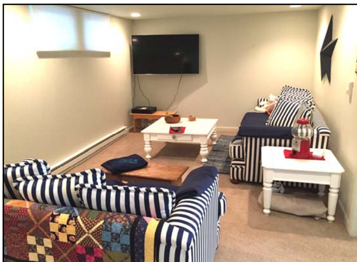
FAMILY ROOM IN BASEMENT