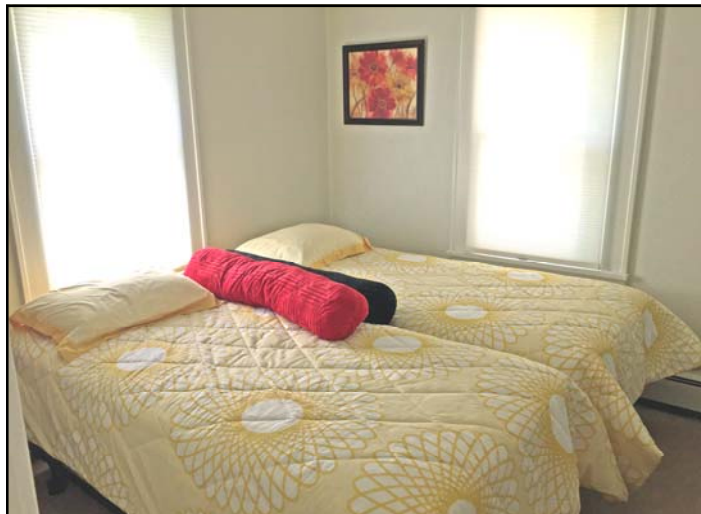
BEDROOM ON MAIN FLOOR