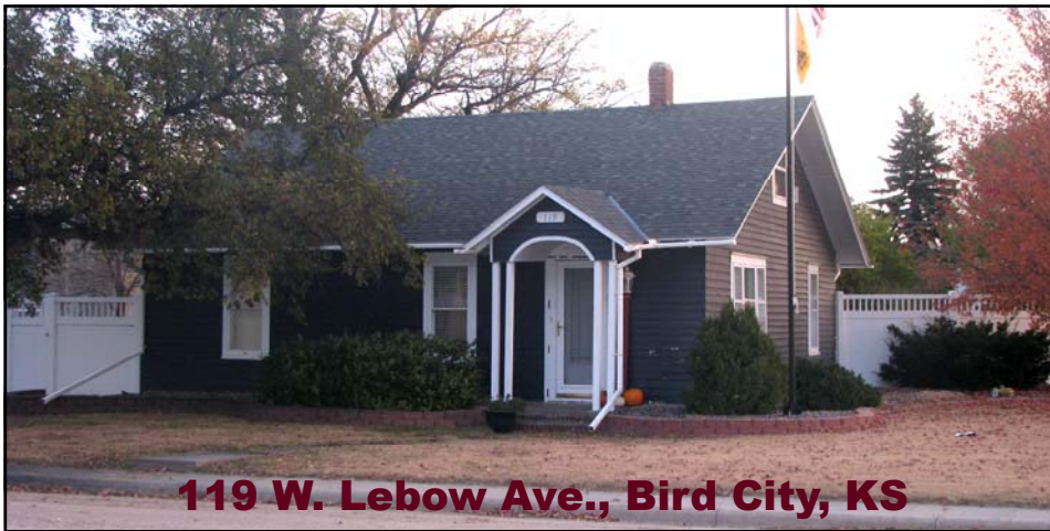
119 W. Lebow Ave., Bird City, KS