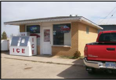
Another View of Bldg.

This property is a "turn-key" operation stocked and ready to open doors for business. Located in downtown Grinnell, off of Interstate 70, approximately 10 miles east of Oakley, KS.